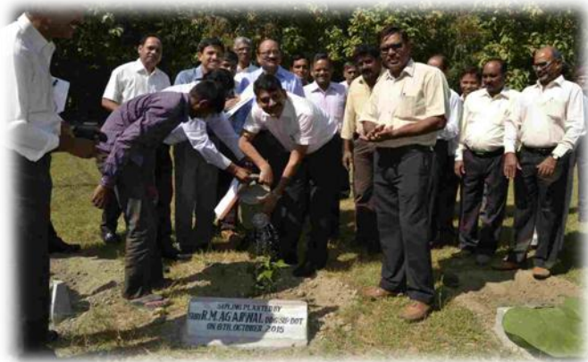
Shri R M Agarwal plants tree in Mankapur plant

The visit by the DoT team was aimed at analyzing the manufacturing infrastructure, land, manpower and other facilities available in the plants and how this can be effectively utilized for implementing new projects. The team was taken around the plants' manufacturing areas and other facilities. Detailed discussions were held with the senior officers on the projects that that plants can take up under the revival plan. DDG (SU) emphasized on the opportunities available for solar park projects in all the plants considering the huge land available. He asked ITI to plan for projects like solar panel manufacturing, Data center, Carrier Ethernet, GPON, HDPE Pipe and Optic Fiber Cable manufacturing, GSM and LTE, Internet of Things etc. He suggested the plants to use its vast infrastructure for contract manufacturing for revenue earning. He also asked the plants to work towards cost reduction, especially, in the areas of energy saving. During the visit to Raebareli plant, Shri R M Agarwal, DDG (SU), inaugurated the newly commissioned environmental chamber.