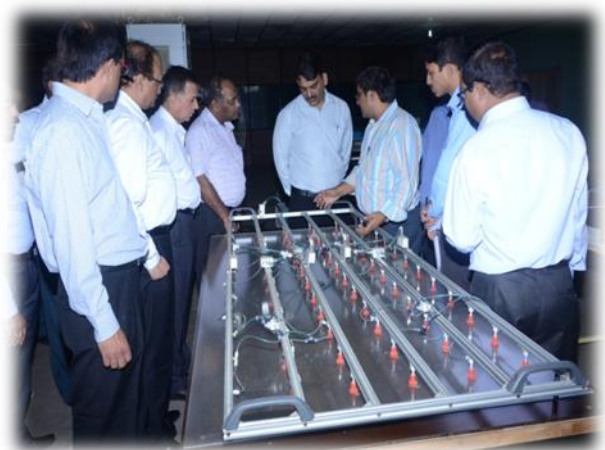
Visit to the Solar Panel manufacturing area in Naini Plant