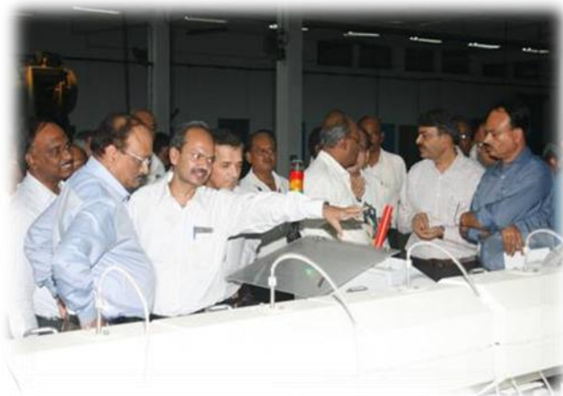
DoT Team visits HDPE Pipe Manufacturing facility in Raebareli plant.