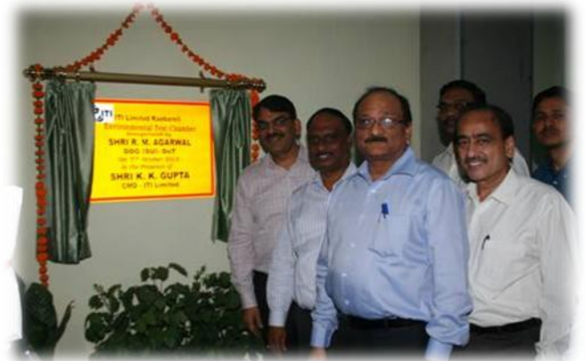
Inauguration of Environmental Chamber facility in Raebareli plant.