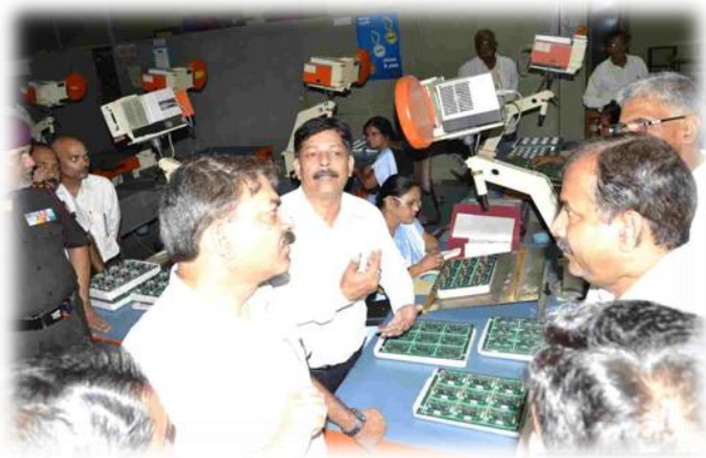
DDG (SU) visits Electronic Assembly Area in Mankapur Plant.